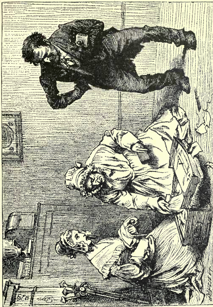
THEY OBEYED MR. QUILP'S DIRECTIONS IN SUBMISSIVE SILENCE.